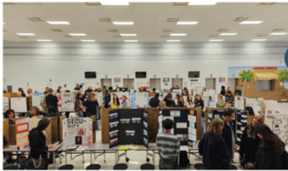
College & Career Gallery Walk March 2023